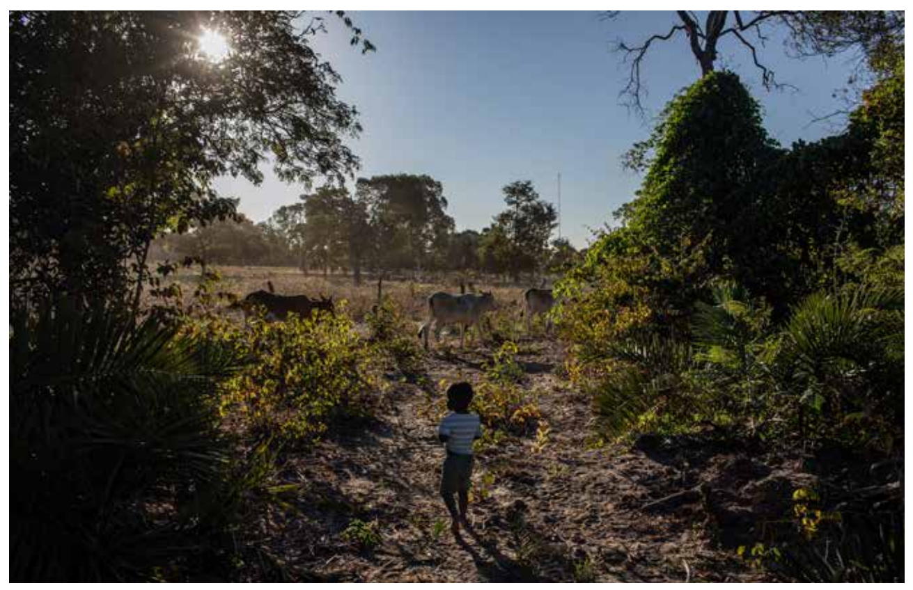
BRAZIL, AUGUST 2020: The Cachoeira community has lived in the region for generations of families. In recent years, conflicts with Fazenda Estrondo have intensified, involving legal disputes and death threats. The Estrondo farm irregularly occupied areas belonging to the community for soy planting. Historically, the Estrondo farm has collected accusations of slave labor and violence against local communities.

commodities that have caused deforestation<sup>126</sup>. EU efforts to reduce soy imports from Brazil or limit imports linked to deforestation could have a significant impact on the global demand for soy from South America, although uncertainty remains about the scope of the legislation in biomes such as the Cerrado.