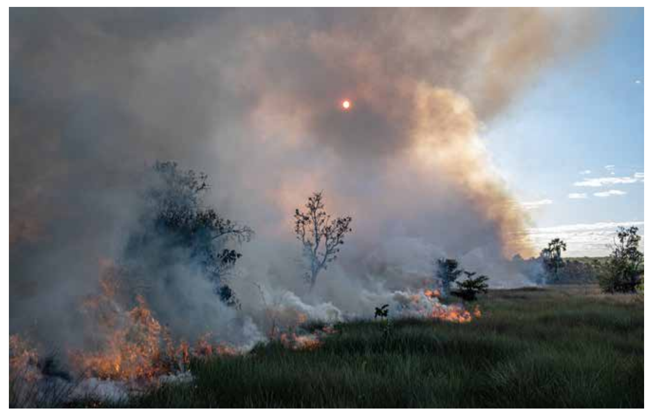
FIRE IN THE CERRADO BIOME, AUGUST 2020.

We identified soy exporter silos registered in the official Conab database (SICARM) in these 25 municipalities in 2019 and 2021. This allows us to review the risk profiles of individual soy traders, as those with silos in municipalities with high deforestation rates may be more at risk.