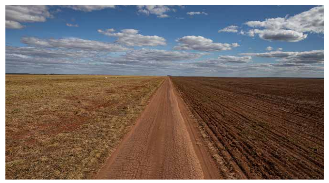
A SOY PLANTATION IN THE STATE OF TOCANTINS, BRAZIL, AUGUST 2020

The soy industry is at a turning point. What the industry decides to do in the coming years to tackle its deforestation footprint may have far-reaching consequences for biodiversity, climate, food security and the future economic profitability of the sector itself.