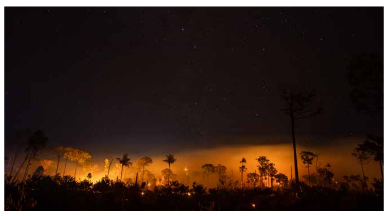
FIRE IN THE AMAZON BIOME, AUGUST 2020.

At the COP 26 in Glasgow in November 2021, major commitments were made to end commodity driven deforestation. Pledges were launched by countries<sup>1</sup>, financial institutions<sup>2</sup> and companies, including agricultural trading companies<sup>3</sup>. While these commitments are welcome, it not the first time these types of commitments have been made. Since the early 2010s, there has been a cascade of commitments to end deforestation caused by commodity production by companies ranging from aquaculture to consumer goods companies and commodity traders<sup>4</sup>. Several corporate actors have also engaged in stakeholder platforms and signed various calls for action.