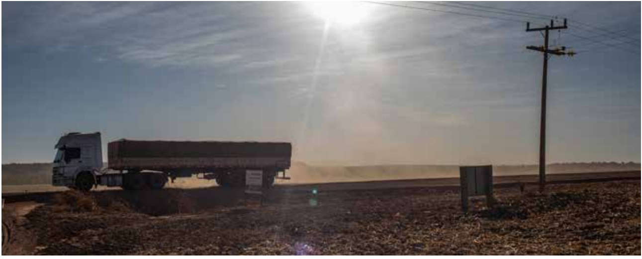
BRAZIL, AUGUST 2020: Trucks loaded with soybeans on a farm in the city of Barra do Ouro in the state of Tocantins.

Traders must develop more robust partnerships and/ or impose more stringent requirements with intermediaries like silos and cooperatives for tracing and monitoring their suppliers.