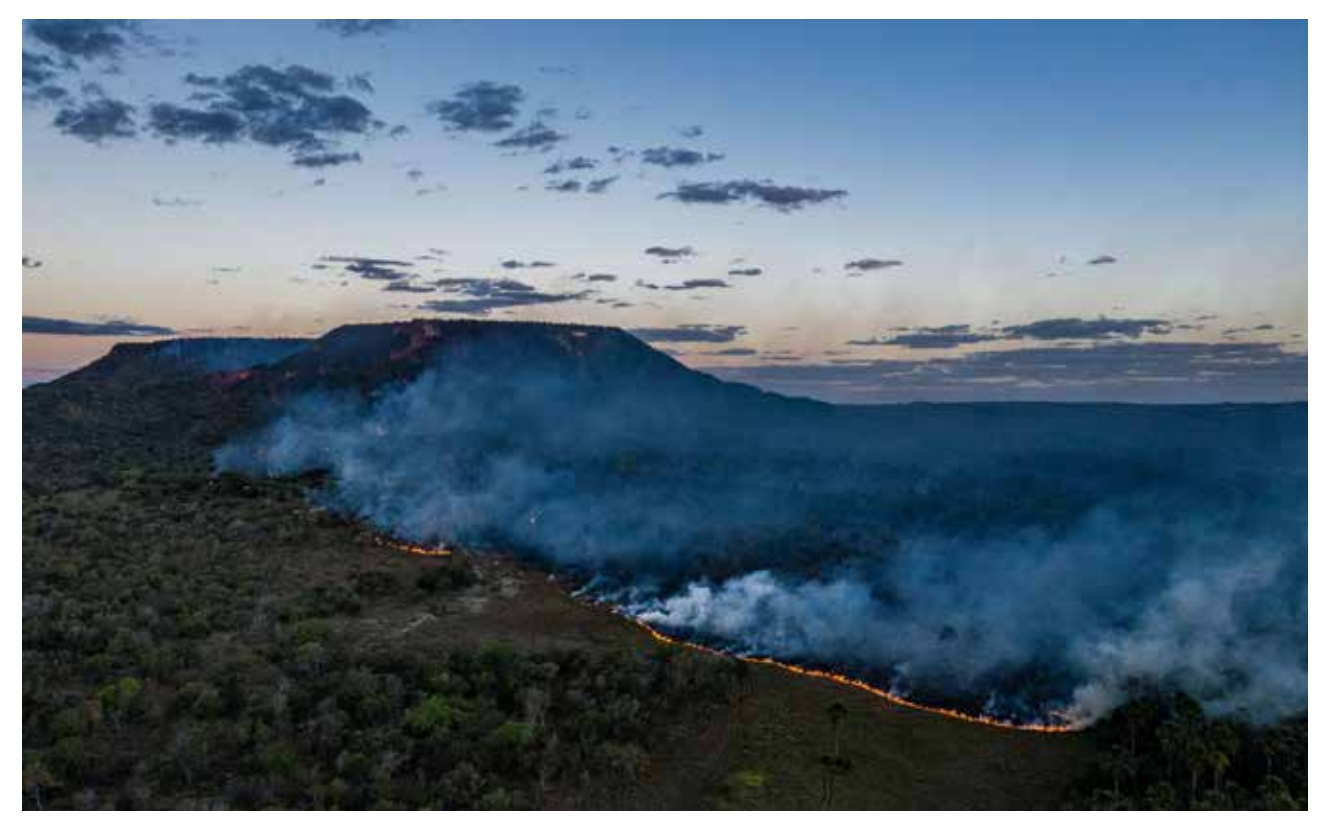
FIRE IN THE CERRADO BIOME, AUGUST 2020.